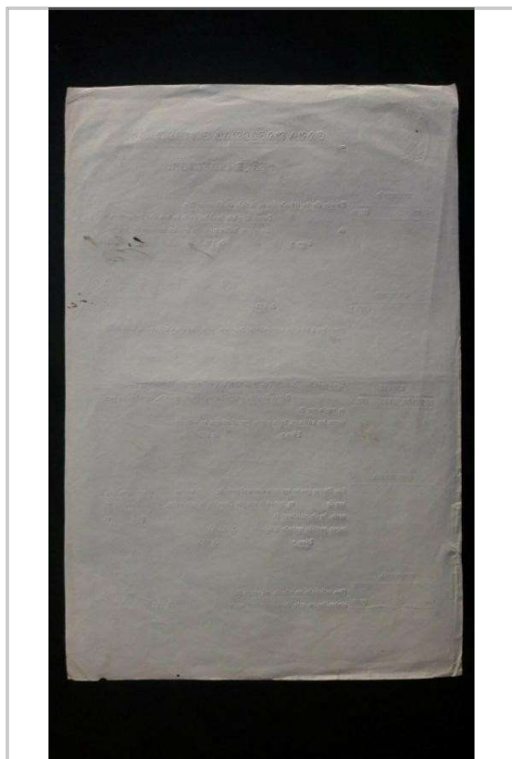
Image: Rear View